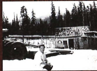
AV Museum PN11493 Cook sitting in the snow

The cookhouse was the center of camp life. Here the single men ate and everyone stopped for a cup of coffee, warmth and conversation. The cookhouse was one of the original mill site buildings, probably constructed in 1927. It included a dining room, kitchen and west bedroom. The pantry on the north side was possibly part of this original configuration. The windows of the pantry were screened and the west and east walls were lined with shelves. An icebox sat in one corner. A few years later, a second bedroom was added on the southwest corners of the dining room. Located across the road was a root house, built in 1937, providing vegetable storage.