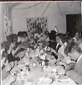
AV Museum PN13756 wedding reception; bride and groom at the head of table

The cook prepared meals on a big, cast iron stove and served the food on heavy, white crockery dishes. Hot and cold running water was available, as a pipe had been directed behind the stove to heat it. Meals were hearty, no-nonsense fare. Breakfast typically consisted of eggs, bacon and hotcakes. For supper, the men looked forward to meat, potatoes, vegetables and homemade bread with pies and cake for dessert. Conservation was, by choice, minimal during mealtime.